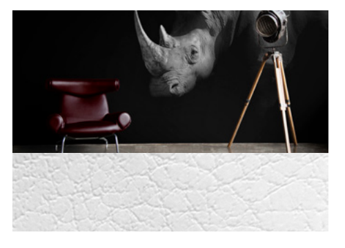
MPI™ 8726 Textured Stone