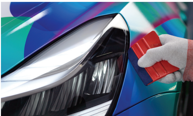
Superb 3D conformability for demanding vehicle and fleet wrapping projects.