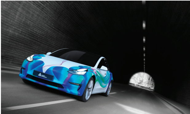
Maximum outdoor durability, up to 10 years unprinted and 6 years printed*.