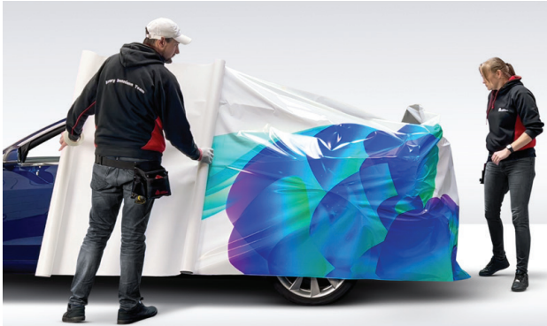
Easy repositioning due to Easy Apply™ technology and a low initial tack.