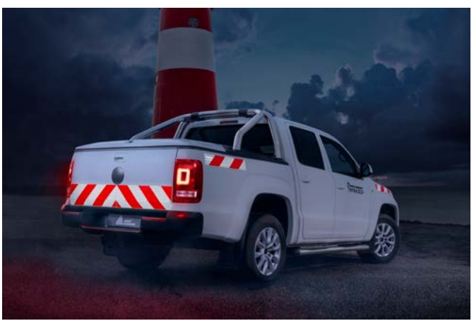
Avery Dennison Chevron White/Red used for vehicle marking according to DIN30710 and TPESC-B.

Avery Dennison Chevron White/Red used for container hazard marking.